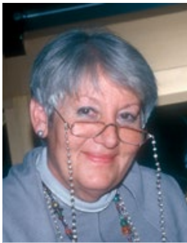
Dr. Brita Gudjons

1) The homeopathic aspect of quality (HQ): The identity with the raw material of the proofing is a prerequisite. 2) The pharmaceutical aspect of quality (PQ): It decides upon the provisions of the homeopathic pharmacopoeia