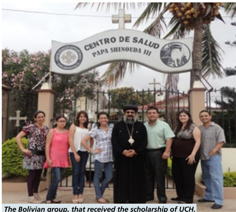
The Bolivian group, that received the scholarship of UCH.