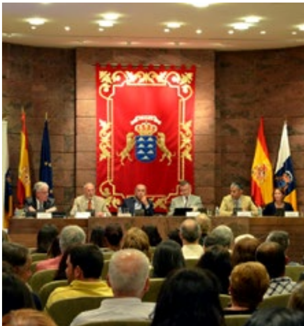
9 th April. Conference.