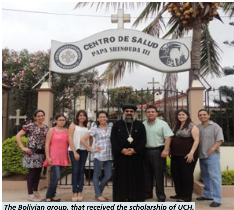
The Bolivian group, that received the scholarship of UCH.